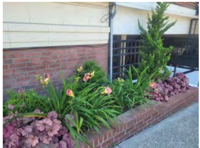
Front Garden planting maintained by Vertumni Landscaping

And we are also grateful for the generosity of those who have donated to HLP, including $9,212 this past fiscal year. These financial gifts enable us to continue to preserve the beautiful red brick building at Sixth and Spring.